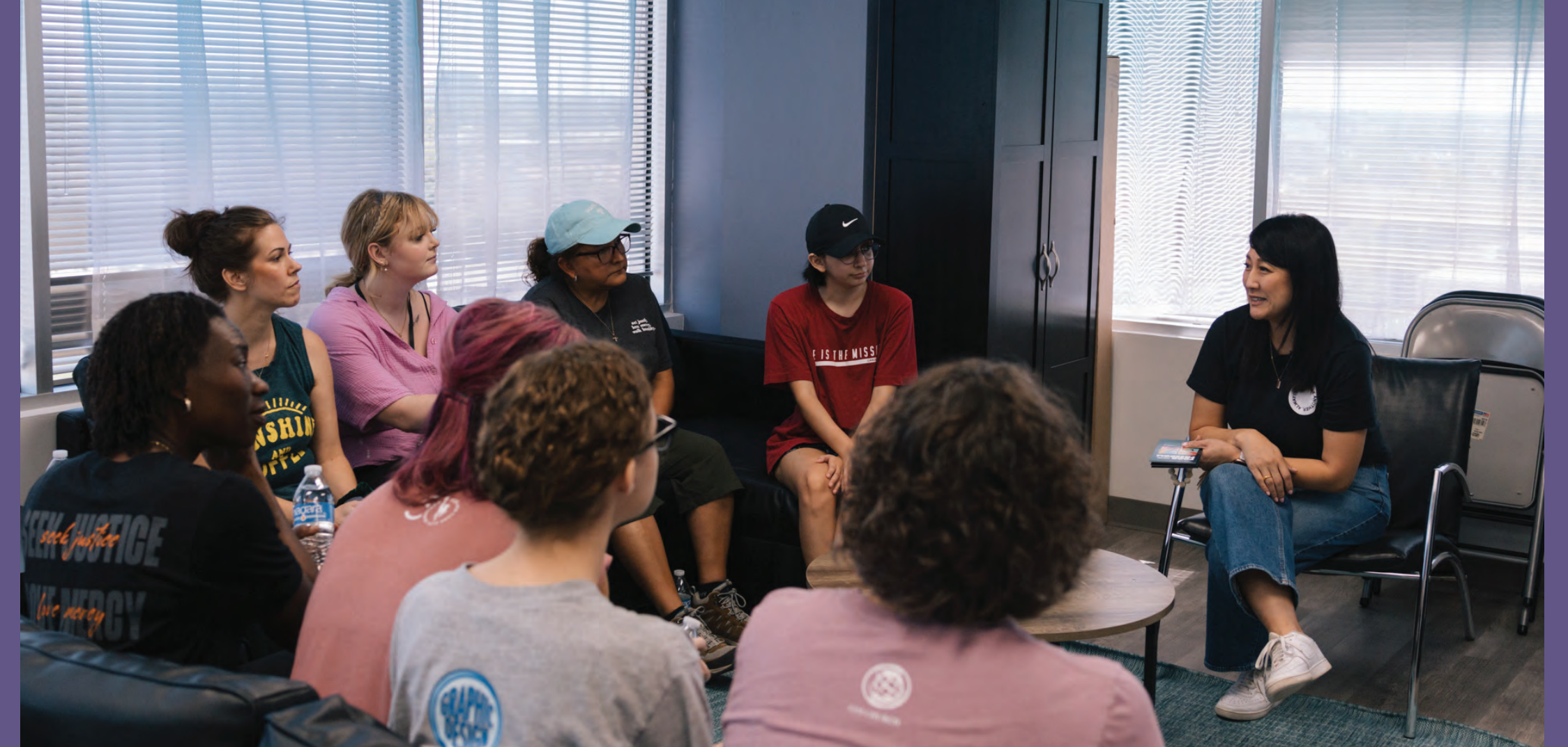
VOLUNTEERS LEARNING MORE ABOUT THE LANDING'S VISION AND DROP-IN CENTER