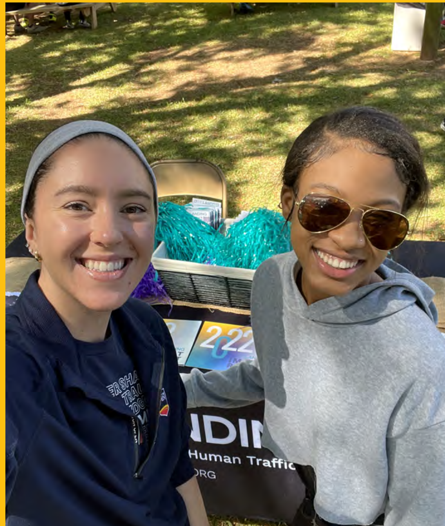
RAISING AWARENESS AT JUST RIDE FOR A JUST CAUSE