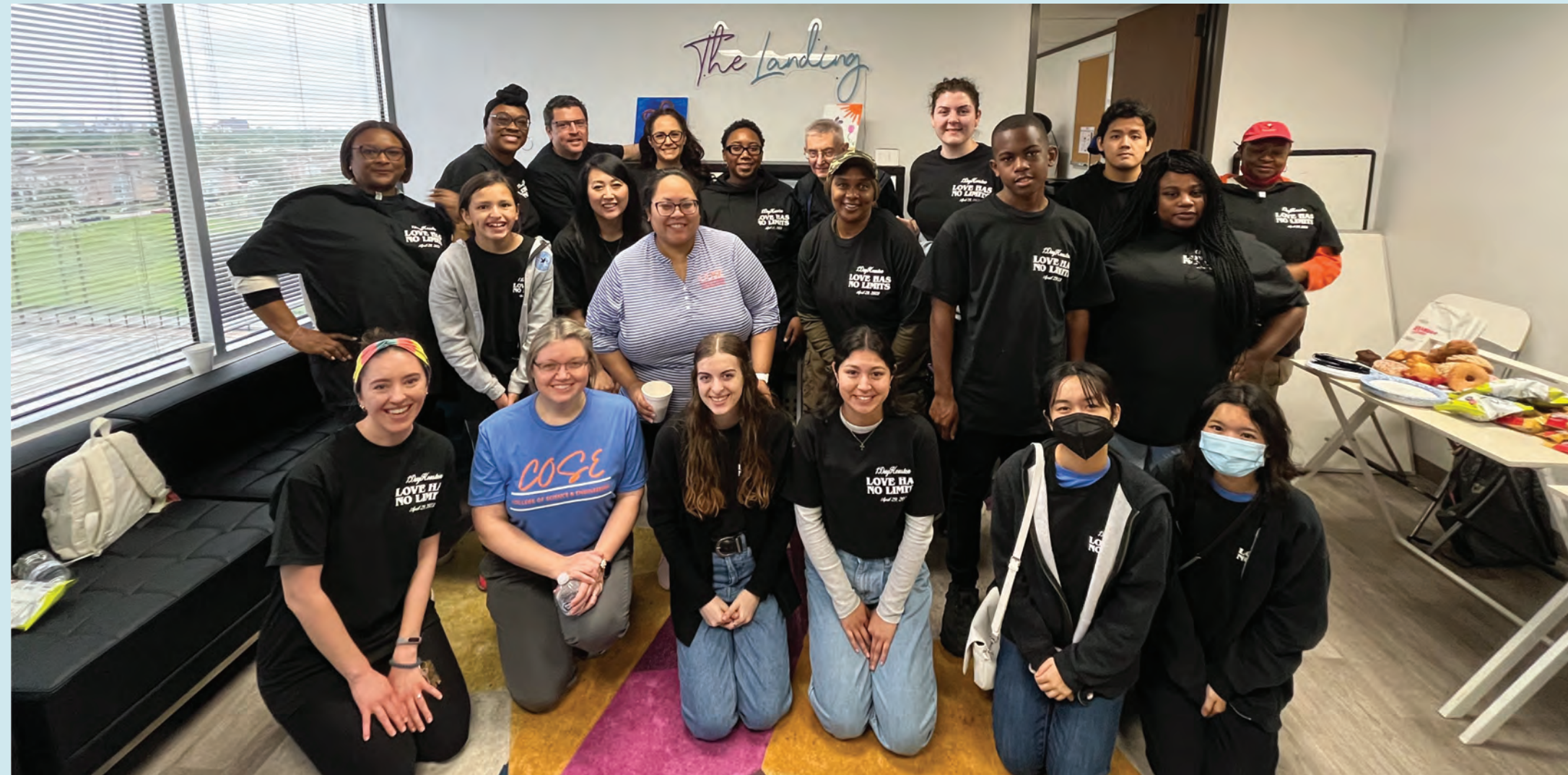
1DAY HOUSTON VOLUNTEERS WHO HELPED CLEAN AND PRAY OVER THE DROP-IN CENTER