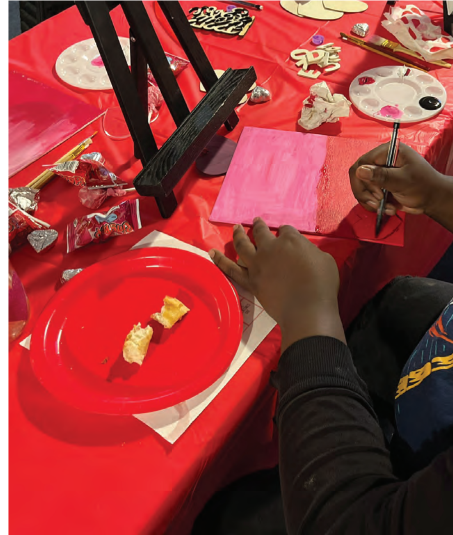
YOUTH GALENTINE'S PAINTING PARTY