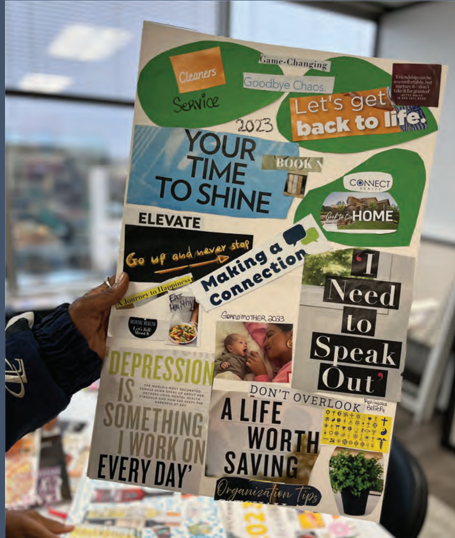
SURVIVOR'S 2023 VISION BOARDS